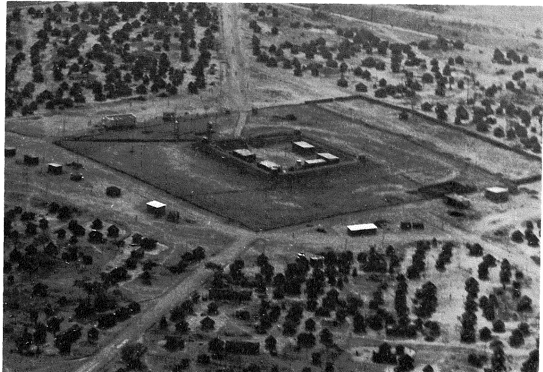
Aerial view of part of a "protected village", showing the Internal Security Keep in the centre.