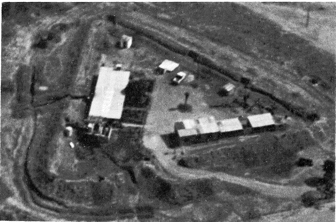
Close-up view of the Internal Security Keep of another "protected village".