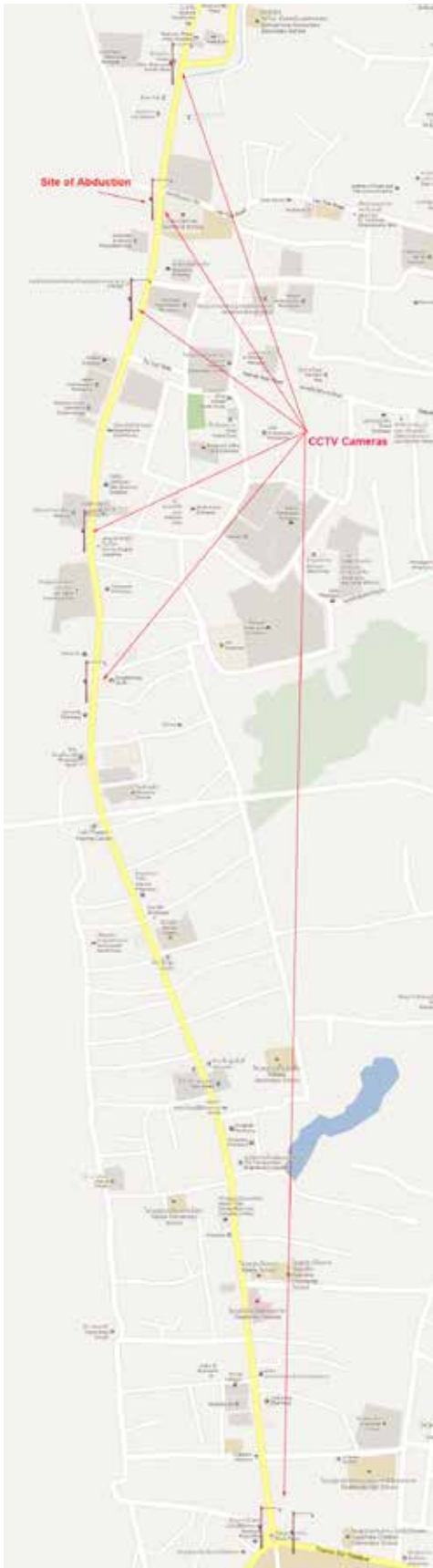
Other possible locations of CCTV cameras near the site of the police checkpoint

Action should also be taken to map the entire Vientiane city area and entry together with exit points to the city. This will identify the most probable routes through the city and routes to and from the location of the checkpoint. Then a visual trawl on the ground should be undertaken to identify the relevant CCTV sites.