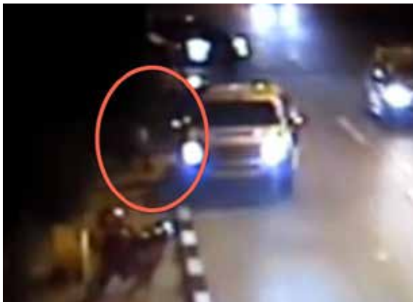
CCTV: Sombath Somphone enters pickup

Potentially, CCTV footage could also play an important role in shedding light on the fate and whereabouts of Sombath Somphone.