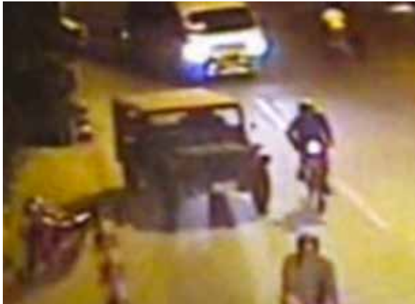
CCTV: Sombath Somphone's vehicle is driven away