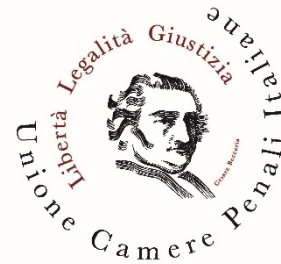
Unione delle Camere Penali Italiane Union of the Italian Criminal Chambers