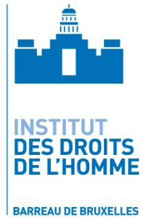
Institut des droits de l'homme du barreau de Bruxelles