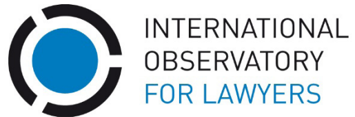
International Observatory for Lawyers in Danger (OIAD) / Observatoire International des Avocats en Danger (OIAD)