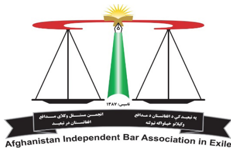
Afghanistan Independent Bar Association In Exile (AIBAIE)