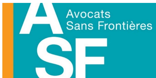
Avocats sans Frontières (Belgique)