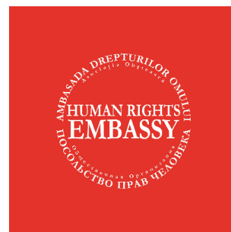
Human Rights Embassy