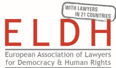
European Association of Lawyers for Democracy and World Human Rights (ELD H)