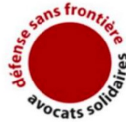
Avocats solidaires – Défense sans frontières