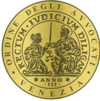
Ordine degli Avvocati di Venezia Venice Bar Association (Italy)