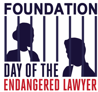
Foundation "Day of the Endangered Lawyer"